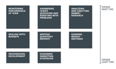
Click here for a larger image of the graphic.

Once she has created her before diagram, this midlevel marketing manager immediately sees that she's spending lots of time on tasks that don't engage her passions—for instance, monitoring her team's performance, answering questions, and directing market research—and much less on tasks that are meaningful to her.